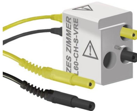
Figure 1: View of an VRE-Adapter for S3-channels

From an instrumentation point of view, the shift from AC to DC calls for adaptations on the test & measurement side as well. After all, going for greener forms of energy does not mean we can become careless when it comes to losses and efficiency. Even if we disregard the cost, there are other good reasons to avoid wasting energy. With charging points anything but ubiquitous yet and charging times considerably exceeding classic hydrocarbon refills, every additional mile squeezed out of the battery helps to make the transition from combustion to e-mobility more attractive. And what was valid for previous applications still holds true: the lower the efficiency, the more heat dissipated, the worse reliability and longevity of the product or component.