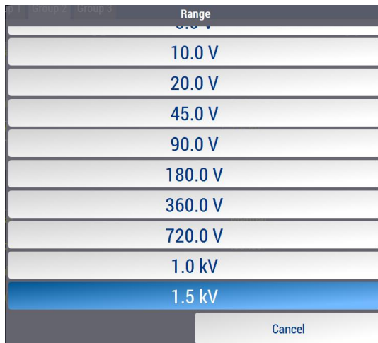
Figure 5: DC ranges selection

ZES ZIMMER’s new S-channel offers tailor-made measuring ranges for both AC and DC. When set to AC mode, the difference between nominal and peak values will allow for real-life crest factors. When set to DC mode, the nominal value will be closer to the maximum, suggesting a more intuitive choice of the range offering the best accuracy. In the above example, the 400V upper limit would correspond to a 250V range when set to AC, and a 360V range when set to DC.