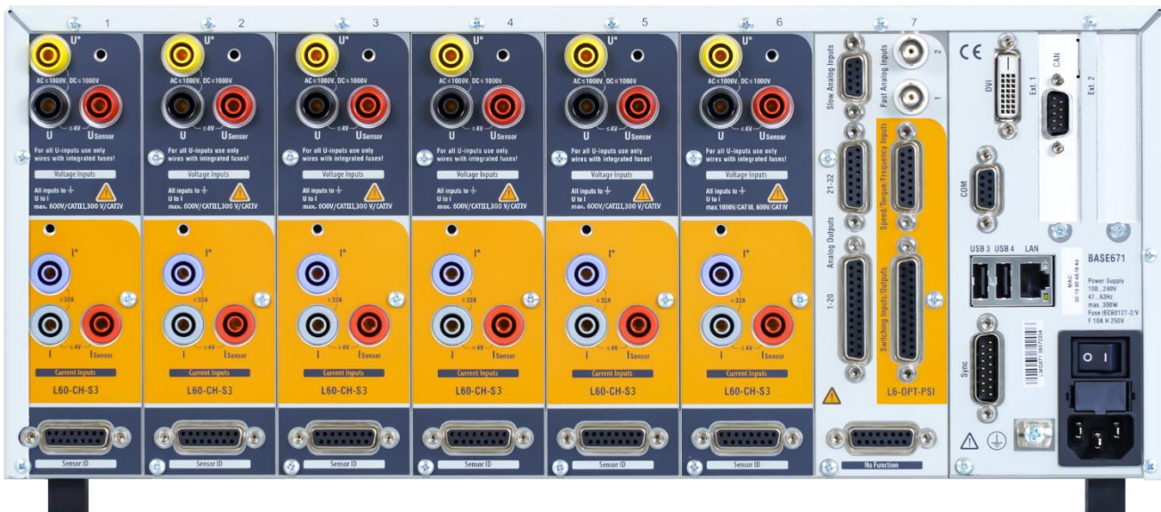
Figure 2: Rear Panel of the LMG671 equipped with 6 S3-channels